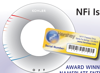
AWARD WINNING NAMEPLATE ENTRIES

When the best printers in the world competed in the Specialty Graphic & Imaging Association (SGIA)'s Golden Image competition last fall, NFi stood out, leaving with two gold awards, one for a screenprinted and one for a digital imaged nameplate.