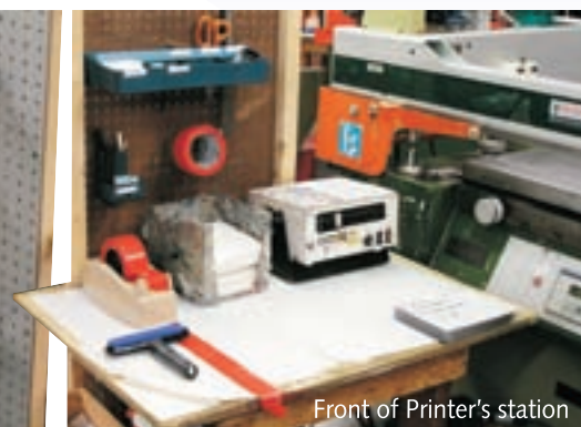
Front of Printer's station

NFi HAS ELIMINATED CLUTTER AND SET NECESSARY TOOLS AND SUPPLIES IN ORDER