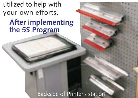
Backside of Printer's station