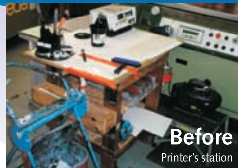
Before Printer's station